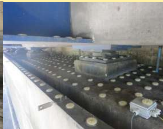
10 Bird Free applied to bearing shelf