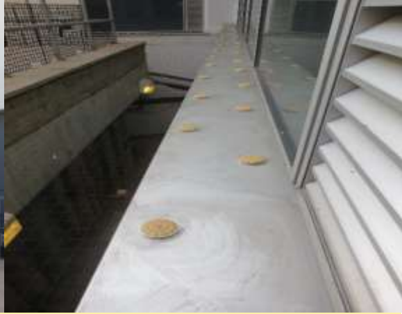
18 Bird Free applied in August 2013

The photos below were taken on 2 June 2018. The Bird Free gel has become clogged with dust and dirt. Despite this there are no pigeons present, almost five years after Bird Free was installed.