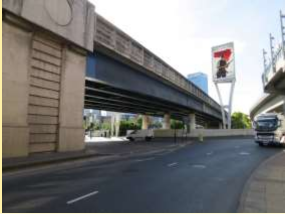
5 Preston's Road flyover

Pigeons had been nesting behind the supports, and in the corners of the superstructure.