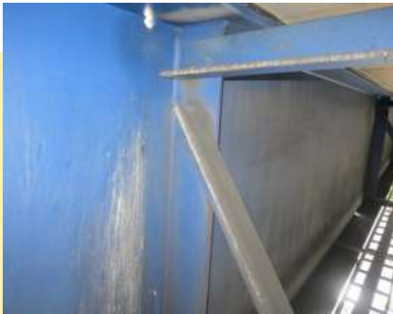
7 Pigeons roosted in corners of superstructure