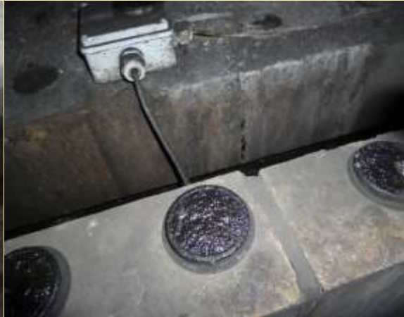
14 Form of Bird Free remains stable