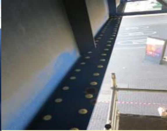
12 Bird Free applied to flanges above road

The photos below were taken 30 minutes before sunset on 29 April 2018. The pigeons had not returned. Despite having become black below the flyover, Bird Free remains effective.