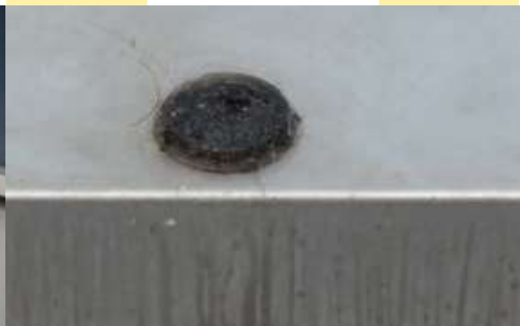
22 Clogged with dirt and dust, June 2018