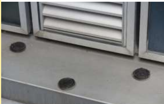
21 No bird droppings, June 2018