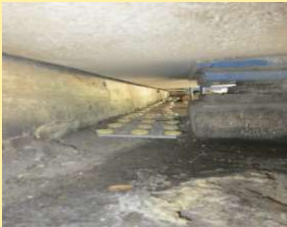
9 Bird Free applied behind supports to prevent nesting

The infested areas were treated with Bird Free in July 2015.