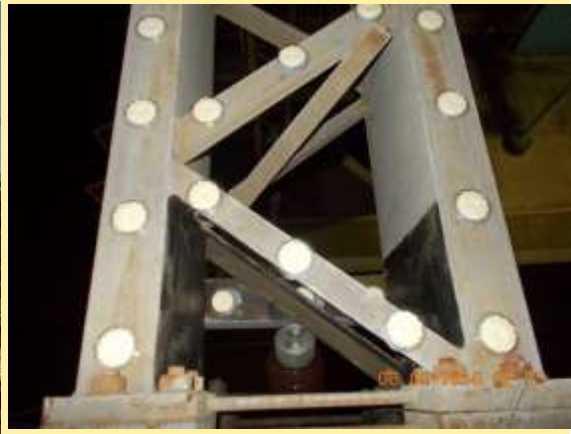
2 Bird Free applied to gantry, August 2016