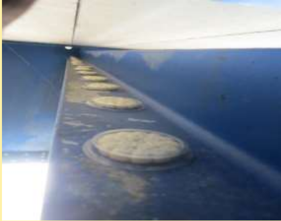
11 Bird Free applied to flanges of superstructure