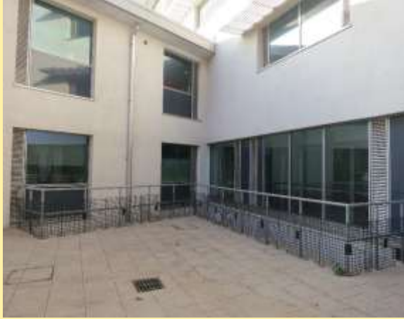
17 Pigeons roosted in sheltered corner

In August 2013, Bird Free was installed on the window ledges shown below, where pigeons had been roosting.