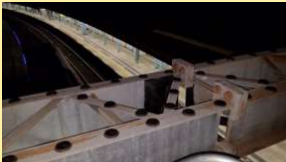
3 Bird Free black with pollution, March 2018