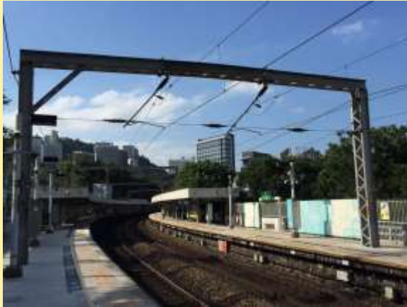
1 Gantry with nests