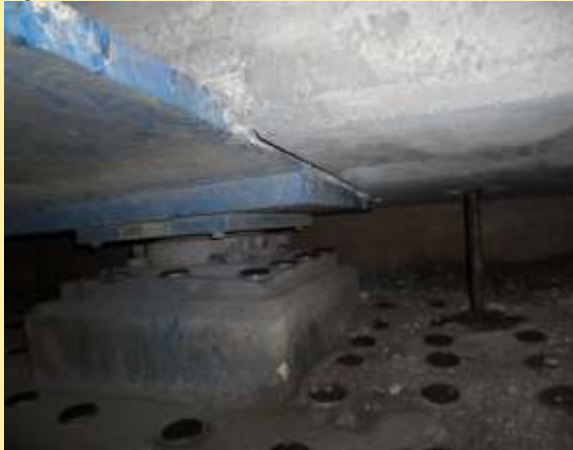
13 Bird Free on bearing shelf black with pollution

The photos below were taken 30 minutes before sunset on 29 April 2018. The pigeons had not returned. Despite having become black below the flyover, Bird Free remains effective.