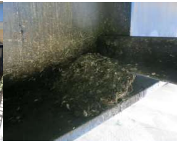
8 Fouling below night roost

The infested areas were treated with Bird Free in July 2015.