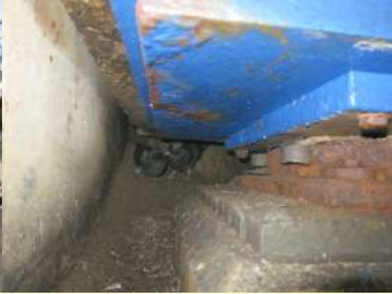
6 Pigeons nested behind supports