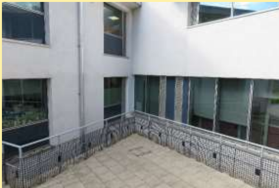
19 June 2018

The photos below were taken on 2 June 2018. The Bird Free gel has become clogged with dust and dirt. Despite this there are no pigeons present, almost five years after Bird Free was installed.