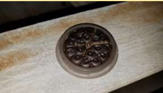
4 Form of Bird Free remains stable, March 2018

Photo 1: Gantry above the railway on which birds were nesting.